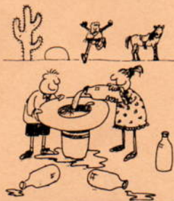
A ten-gallon hat holds barely 6 pints (3.4 litres).