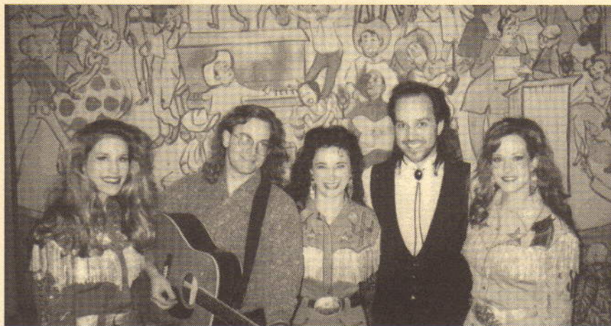
Enjoying ourselves back stage at the Grand Ole Opry, Nashville, TN.