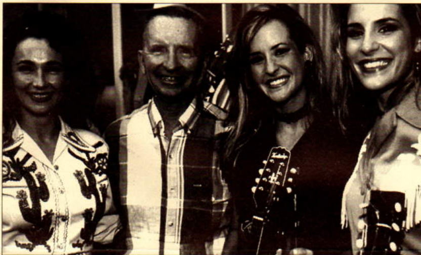
When Ross Perot was spotted with a couple of Chicks, it made the front page of The New York Times .