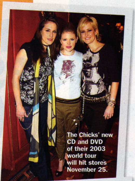
The Chicks' new CD and DVD of their 2003 world tour will hit stores November 25.