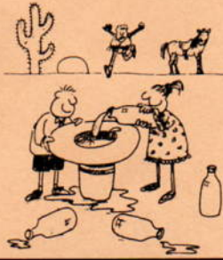
A ten-gallon hat holds barely 6 pints (3.4 litres).