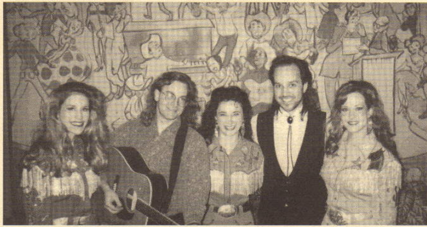
Enjoying ourselves back stage at the Grand Ole Opry, Nashville, TN.