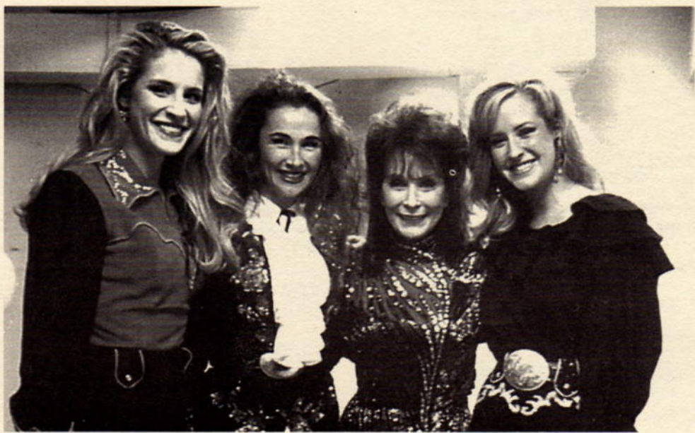
We "played famous" with Loretta Lynn at Freeman Auditorium in San Antonio, TX.